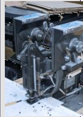
Siac quad lever arch fitting machine. 1981. Fully Operational.