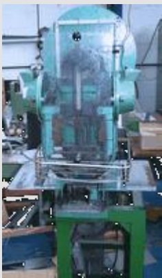
CMC corner trimming machine. Build unknown. Operational.