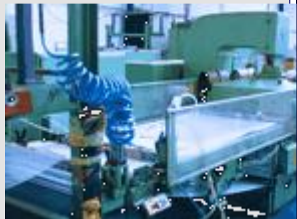
Photo 1101 3 station 10kW rotary air welding machine 600 x 600mm heated