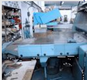
Rosefair TR-10 10kw shuttle welder 1220 x 710mm (non heated). Operational.